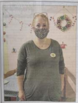
Old Cattle Market makes project in Liskeard has opened to the public and is now open to the public. The new facility is set to open on the site in late summer 2022 - but the scheme is launching this month.